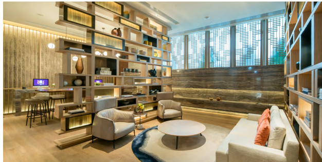
Stylish modern reading lounge 8

Twin Regency is managed by SHKP property management subsidiary Kai Shing offering concierge, housekeeping 3 , catering, limousine, cleaning, pest control and relocation services. In addition, there is a private mini-storage provision, offering 24-hour laundry drop off/pick up, online shopping collection and storage of large objects. Twin Regency also offers a complimentary limousine service for residents to and from the MTR Long Ping Station 5 for the first two years and is about a 120-second 6 drive to and from the station. From MTR Long Ping Station, travel time to East Tsim Sha Tsui is around 26 minutes 6 , around 28 minutes to Hung Hom Station 6 , around 30 minutes to Kowloon Station 6 and around 33 minutes to Hong Kong Station 6 . The development offers residents a prestigious and convenient metropolitan lifestyle.