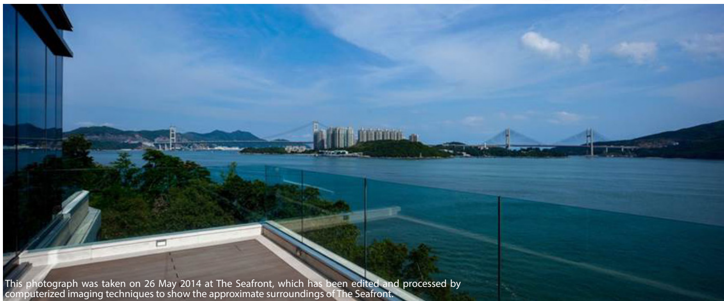
This photograph was taken on 26 May 2014 at The Seafront, which has been edited and processed by computerized imaging techniques to show the approximate surroundings of The Seafront.