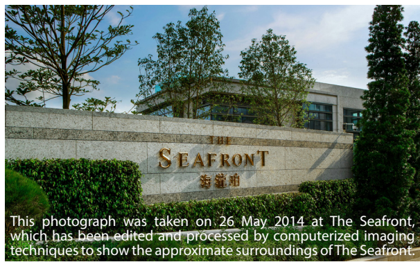
This photograph was taken on 26 May 2014 at The Seafront, which has been edited and processed by computerized imaging techniques to show the approximate surroundings of The Seafront.

Each unit at The Seafront is divided into the ground floor, first floor and roof. There is also a terrace (except House 2), a private garden and carpark(s). Each unit has a total of three en suites and is equipped with kitchen featuring both Chinese and western style. Situated in an upscale location in Tsing Lung Tau, The Seafront is next to the Tsing Ma Bridge, Ting Kau Bridge and Kap Shui Mun Bridge, providing a spacious and comfortable living space.