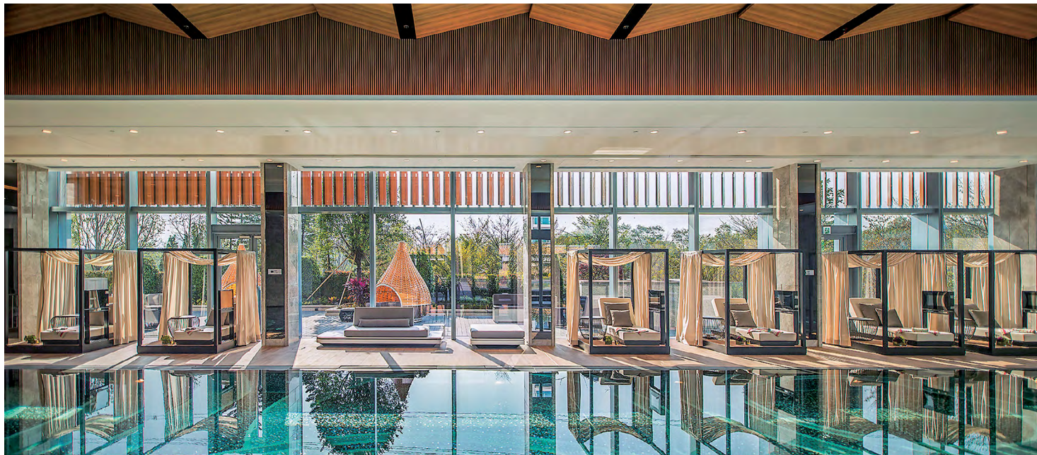
The image was taken at Club COMO on 14 January 2016 and processed by computer