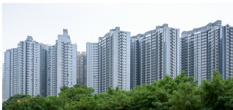
Modern glass facades make Century Link a distinctive Tung Chung landmark 5

Name of the Phase of the Development: Phase 1 ("the Phase") of Century Link Development ("the Development") (Tower 3A and 3B, Tower 5A and 5B, Tower 6A and 6B, Residential Block 1, Residential Block 2 and Residential Block 3 of the residential development in the Phase are called "Century Link")