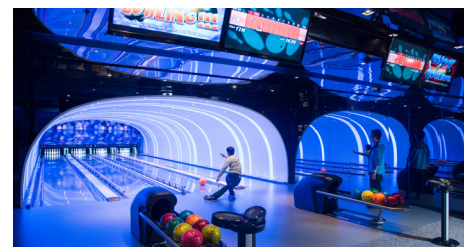
Four-lane bowling alley in neon glow 4