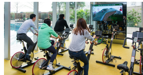
Stationary bikes with big screen display 4