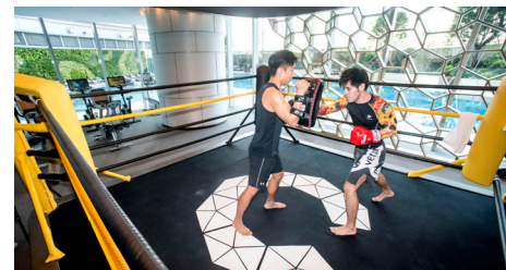
Prominent boxing ring in the gym 3

5 This photograph was taken at Century Link Development on 11 November 2016. It has been processed with computerized imaging techniques and is for reference only.