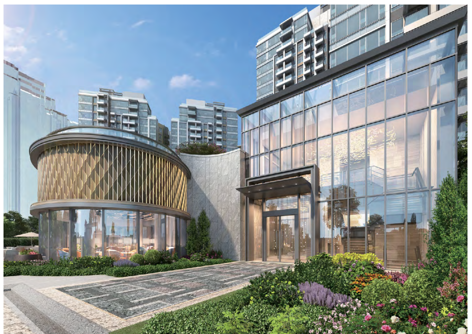
St Martin's private residential clubhouse features a stylish Director's House 5