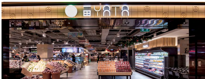
YATA Supermarket (Shatin)

To take care of the daily living and dining needs of residents, St Martin has collaborated with YATA Supermarket to create a shopping page on the Intelligent Living App, which will provide specialty fresh goods, food and groceries. A free delivery service is available for purchases over HK$300. Residents therefore do not even need to leave the house. With a choice of two delivery timeslots 2 , residents can tailor a delivery based on individual needs and requirements. Residents can also use the Intelligent Living App to receive the latest information and offers from YATA Supermarket, and pre-arrange orders up to seven days in advance. During the promotional period 3 , a 5% discount at YATA Supermarket (Shatin) can be enjoyed by residents when showing the Intelligent Living App 2,4 .