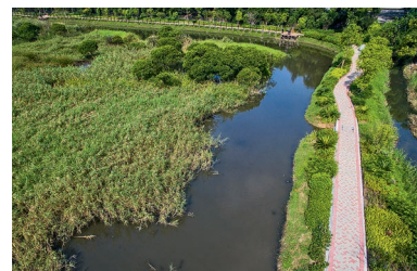
SHKP worked with ecologists to restore the wetland to a rare, semi-natural brackish marsh 4