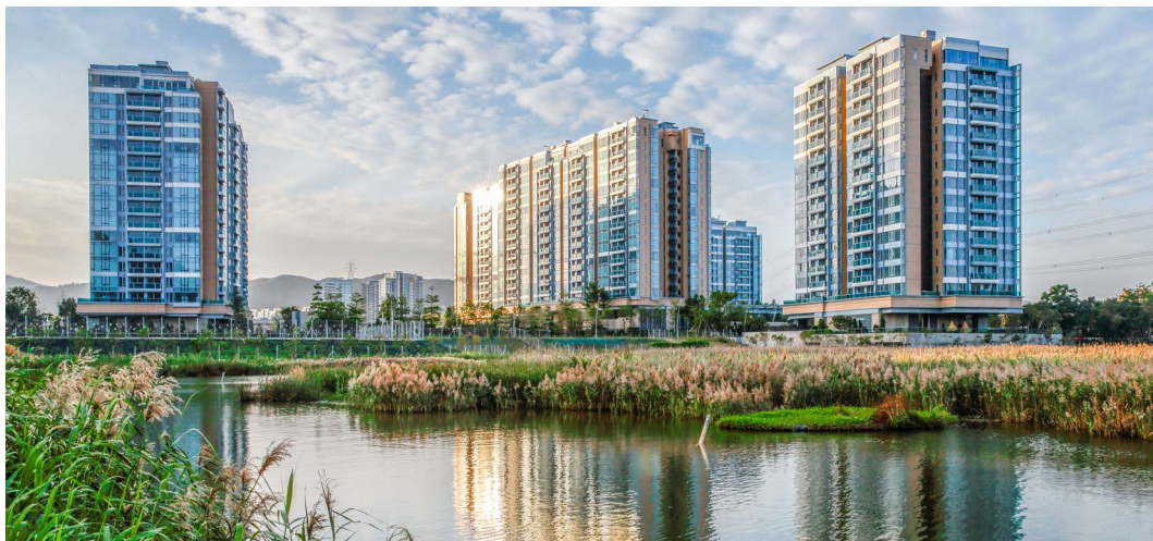
SHKP's thoughtful planning with PARK YOHO 1 demonstrates a balance between residential development and nature 2