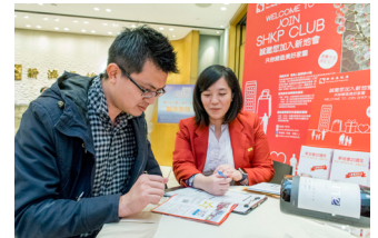
This photo was taken in March 2016 at the "Ocean Wings" sales gallery at IFC where the SHKP Club staff were answering questions from customers about the services and privileges for members of SHKP Club