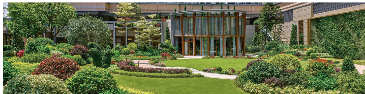
The above image was taken on 29 May 2017 at Club GARDA 2 . It has been processed with computerized imaging techniques.

Name of the Phase of the Development: PARK YOHO Genova District: Kam Tin North