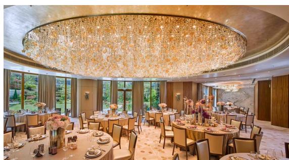
The above image was taken on 29 May 2017 at Club GARDA 2 . It has been processed with computerized imaging techniques.