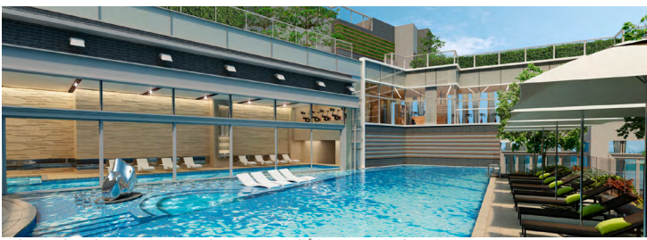
door and outdoor swimming pools at Lagoon Gala" (computer rendering)

The SHKP Club is offering various privileges for Lime Gala. According to the order of priority in the selection of residential property as determined in accordance with the method specified in the Sales Arrangements No.1 (and the revised Sales Arrangements thereof) of the Development, the first eligible purchaser of each of Session A and Session B (at least one individual eligible purchaser (if the eligible purchaser is an individual(s)) or at least one director of the eligible purchaser (if the eligible purchaser is a corporation) is a SHKP Club member on or before the date of signing the preliminary agreement for sale and purchase, and purchase one or more residential properties) will be entitled to a travel gift certificate<sup>5</sup> with the value of HK$75,000 for each. The total value of these two travel gift certificates<sup>5</sup> is HK$150,000. Furthermore, SHKP Club members (at least one individual purchaser (if the purchaser is an individual(s)) or at least one director of the purchaser (if the purchaser is a corporation) is a SHKP Club member) who sign a preliminary agreement for sale and purchase on or before 30 September 2016 will receive a 1% discount<sup>5</sup> on the price; only one discount per unit.