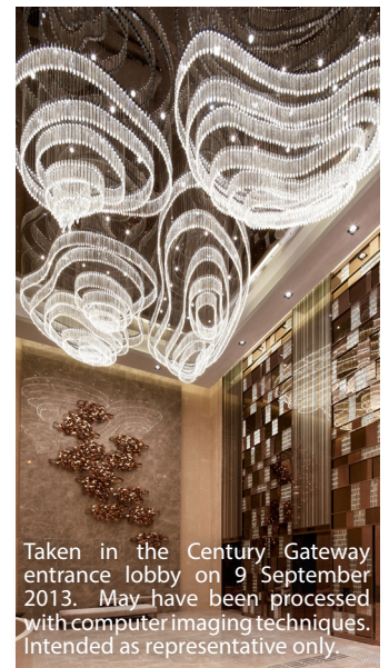
Taken in the Century Gateway entrance lobby on 9 September 2013. May have been processed with computer imaging techniques. Intended as representative only.

* Hong Kong-Zhuhai-Macao Bridge is expected to be completed in 2016.